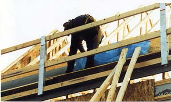
Guardrail 2000 installed over Ice & Water Shield on a 12/12 pitch