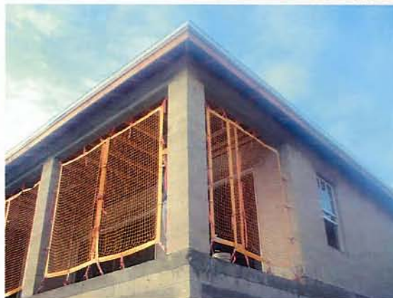
Cocoon your workers inside the building