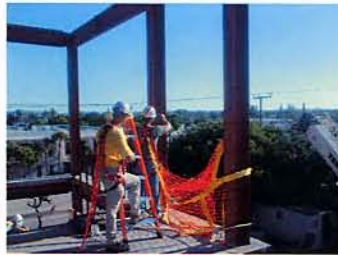
Protect your steel openings from top to bottom.