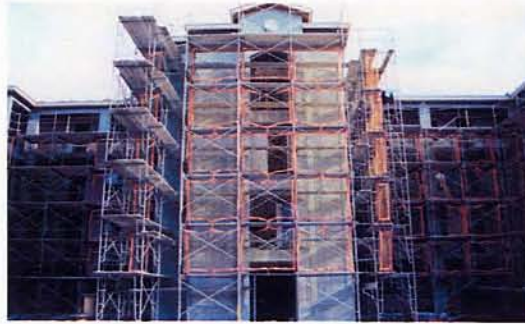
Cocoon your workers inside the scaffolding system