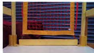
Toeboard accessories available